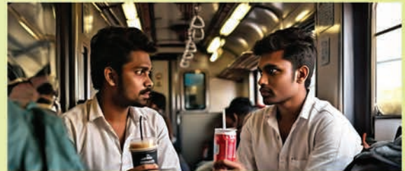
Their conversation continues.